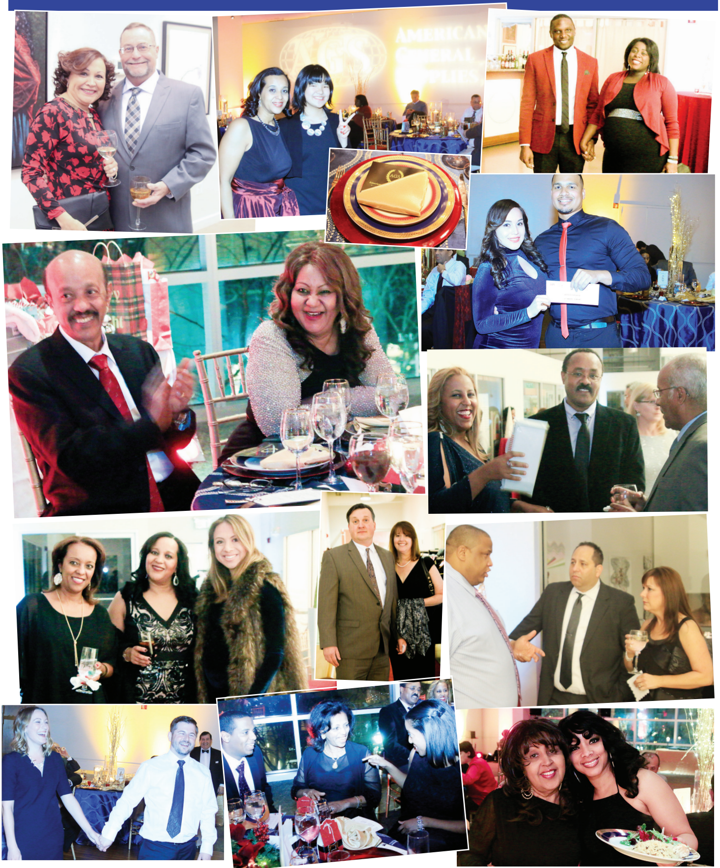
AGS Holiday Party Pictures