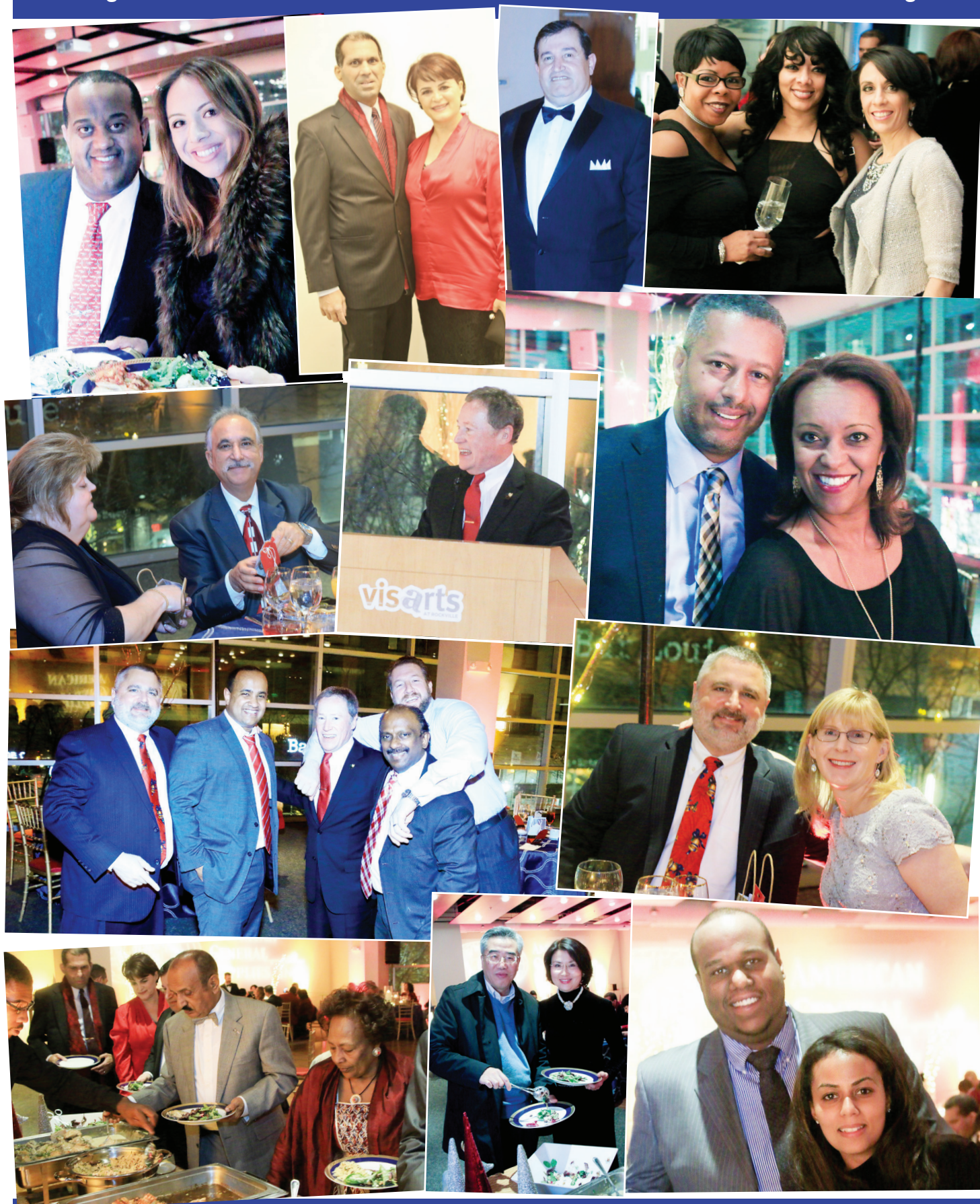
AGS Holiday Party Pictures